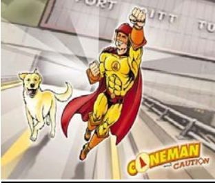
Web-driven rideshare campaign, Downtown Pittsburg, PA