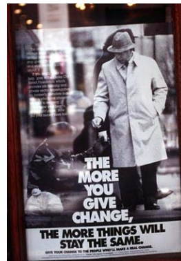
Anti-panhandling campaign, Philadelphia, PA (?)

Areas of downtown feel isolated – The panelists agreed with some of the interviewees who noted that areas of the downtown feel a bit foreboding, a bit isolated. And those ideas lead naturally to a perception of crime and a lack of personal safety.