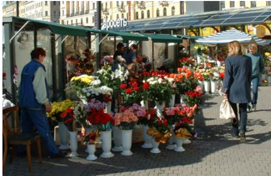
Sennaya Plaza, St. Petersburg, Russia

As mentioned in “Weaknesses, Challenges, and Threats,” Downtown Fresno should by rights host the best fresh foods farmers market in the state, if not the nation. Not only is downtown situated in the middle of the richest agricultural region in the world, it offers one of the best “stages” for fresh foods marketing anywhere – the Fulton Mall.