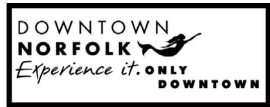
Downtown Norfolk (VA) brand

The proposed Downtown Fresno PBID must take the lead on creating an identity for the district and promoting the brand. ‘A Great Place to Live, Work, and Play’ is not good enough – it’s being used by dozens of downtowns around the country. What downtown leaders need to do is look at the district’s assets and do the following: