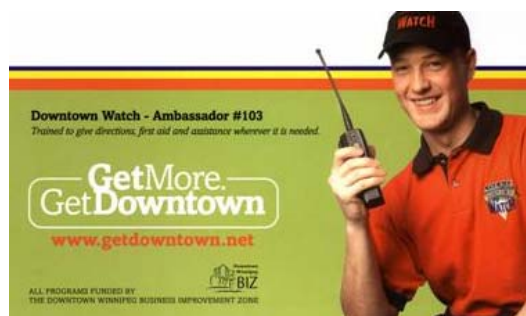
Downtown Winnipeg BIZ Ambassador Program, Winnipeg, AB

Downtown ambassador programs are simply supplemental security programs for the district. They do not substitute for existing police presence, patrols or substations, but do offer the city’s police department additional support.